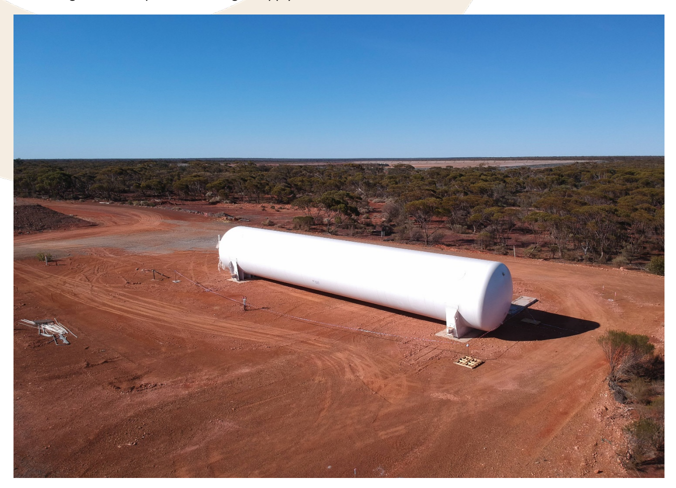
LNG gas storage bullet in position at Davyhurst

Gas storage bullet for power station gas supply which was constructed in China has been delivered to site.