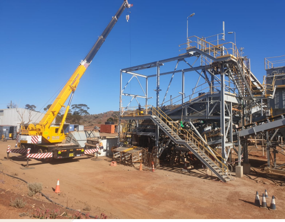
Screen house pulled down ahead of installation of new and improved double screen deck