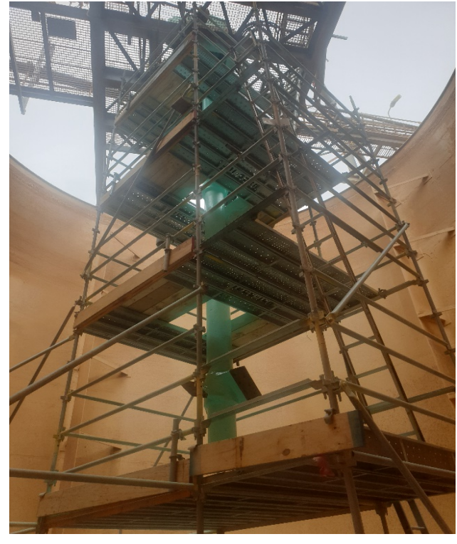
Hydro blasting ahead of concrete repair